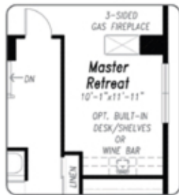
OPT. MASTER RETREAT W/ OPT. GAS FIREPLACE