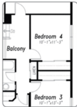
OPT. BEDROOM 4