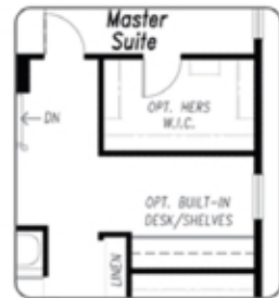
OPT. HERS WALK IN CLOSET W/ OPT. HOMEWORK STATION