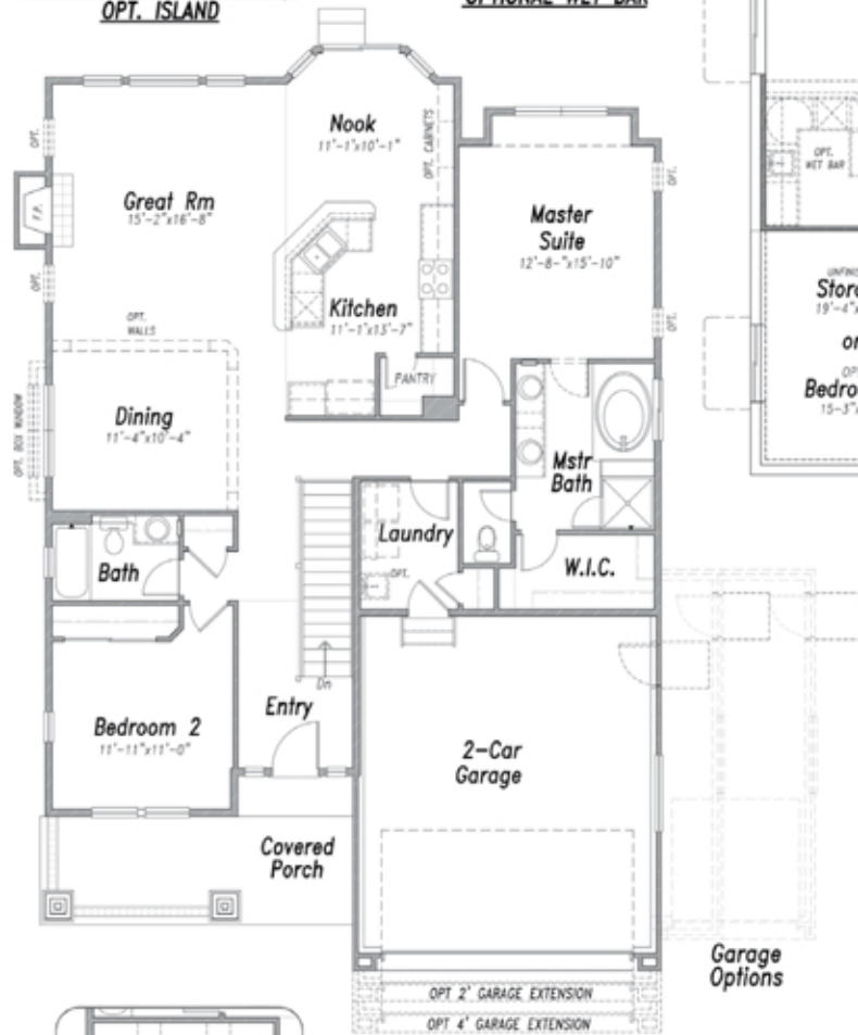
Main Level 1638 SQ FT