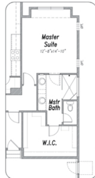
OPT. MASTER BATH