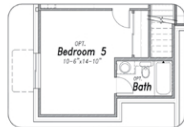
OPT. ENSUITE BATH