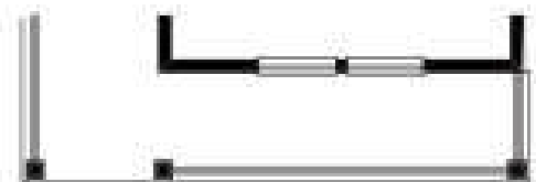
MAIN LEVEL OPTIONAL FRONT PORCH WITH ELEV. B & C