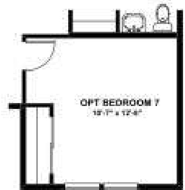
MAIN LEVEL OPTIONAL BEDROOM 7