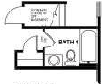
MAIN LEVEL OPTIONAL BATH 4