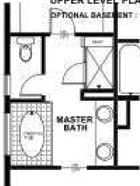
UPPER LEVEL OPTIONAL LUXURY MASTER BATH